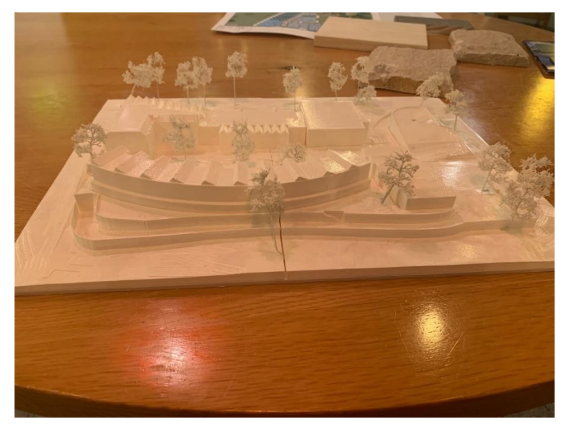
Figure 2 – 3D model to show topography of the site

4. A 3D model of the proposed development was also available to view, helping attendees visualise the topography of the site.