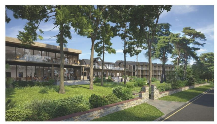
Artist's impression of proposed scheme from Ferry Road

The scale and form of the buildings consider far reaching site views and respond to the surrounding context, with floor levels set to suit the existing topography and external cladding using local materials.